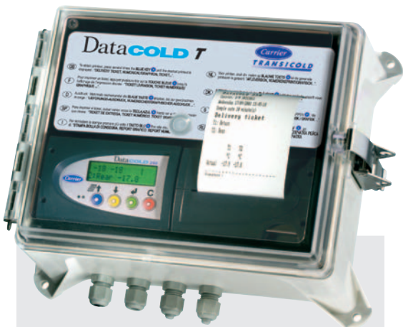
250 T for outside trailer installation.

DataCOLD 250 recorders are tested and approved to the European EN12830 specification, meeting the objectives of directives 92/1/EU and 93/43/EU.