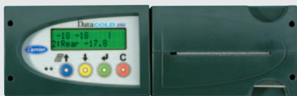
250 R for installation in-cab.